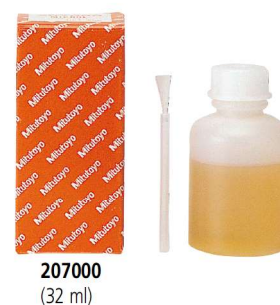
207000 (32 ml)

Note: May not be used for some parts such as the spindle of a dial indicator or Digimatic indicator.